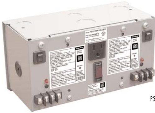
Model Shown: PSH100A100AB10